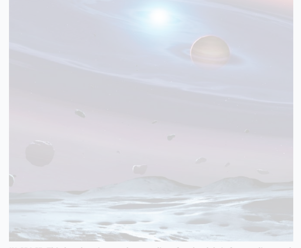
IN SPACE: This handout image shows a disc of rocky debris from a disrupted planetesimal surrounds white dwarf plus brown dwarf binary star.

The discovery came as a "complete surprise," added the team, who assumed the system contained a single star, a white dwarf, only to discover a brown dwarf hidden in the asteroid dust. "But when we observed SDSS 1557 in detail, we recognized the brown dwarf's subtle gravitational pull on the white dwarf," said Steven Parsons of the University of Sheffield. The team studied the system by measuring different wavelengths of light, or spectrausing two large telescopes based in Chile In the Star Wars saga, Tatooine is a desert planet circling two suns, and with three moons of its own.—AFP