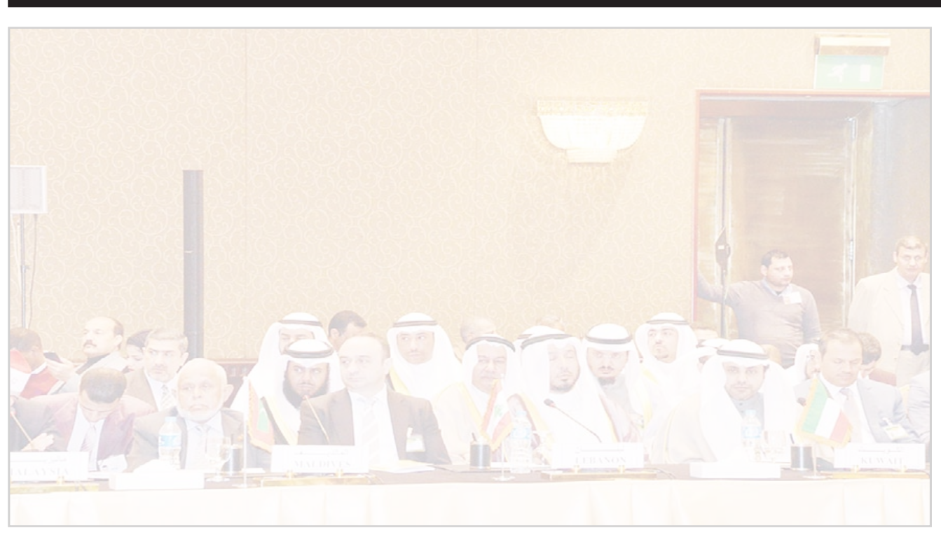
Minister of Awqaf and Islamic Affairs Mohammad Al-Jabri during the 27th Conference of the Supreme Council for