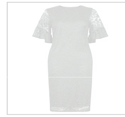
New look SS'17 collection

or Contact Engr Mohandas Kamath (Mob: 67030055) / Engr Sudhir