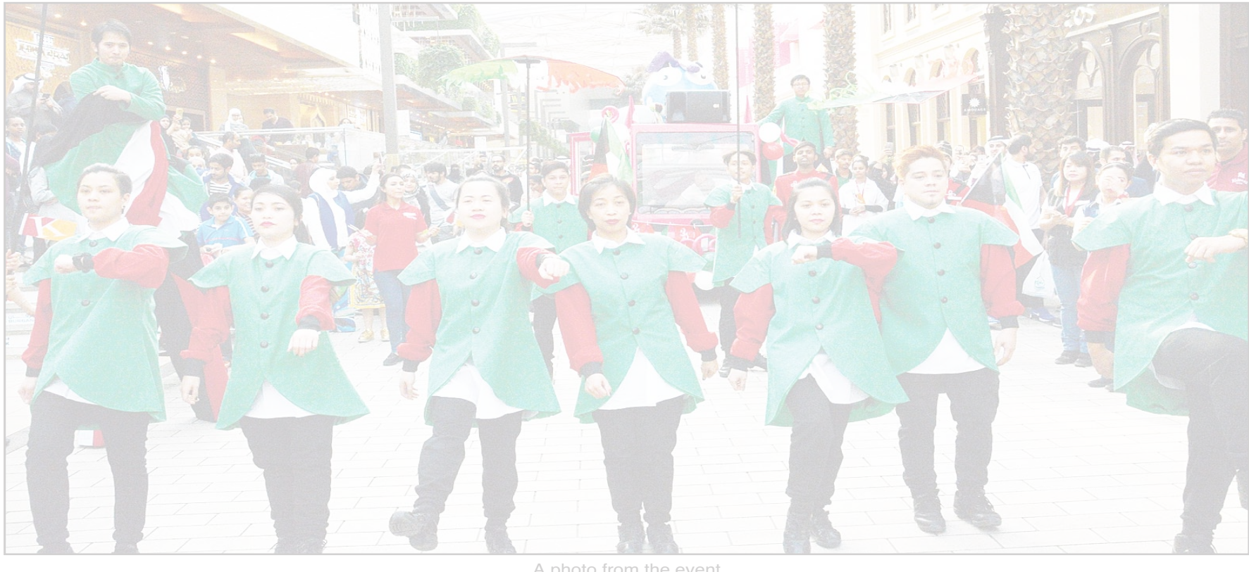
A photo from the event